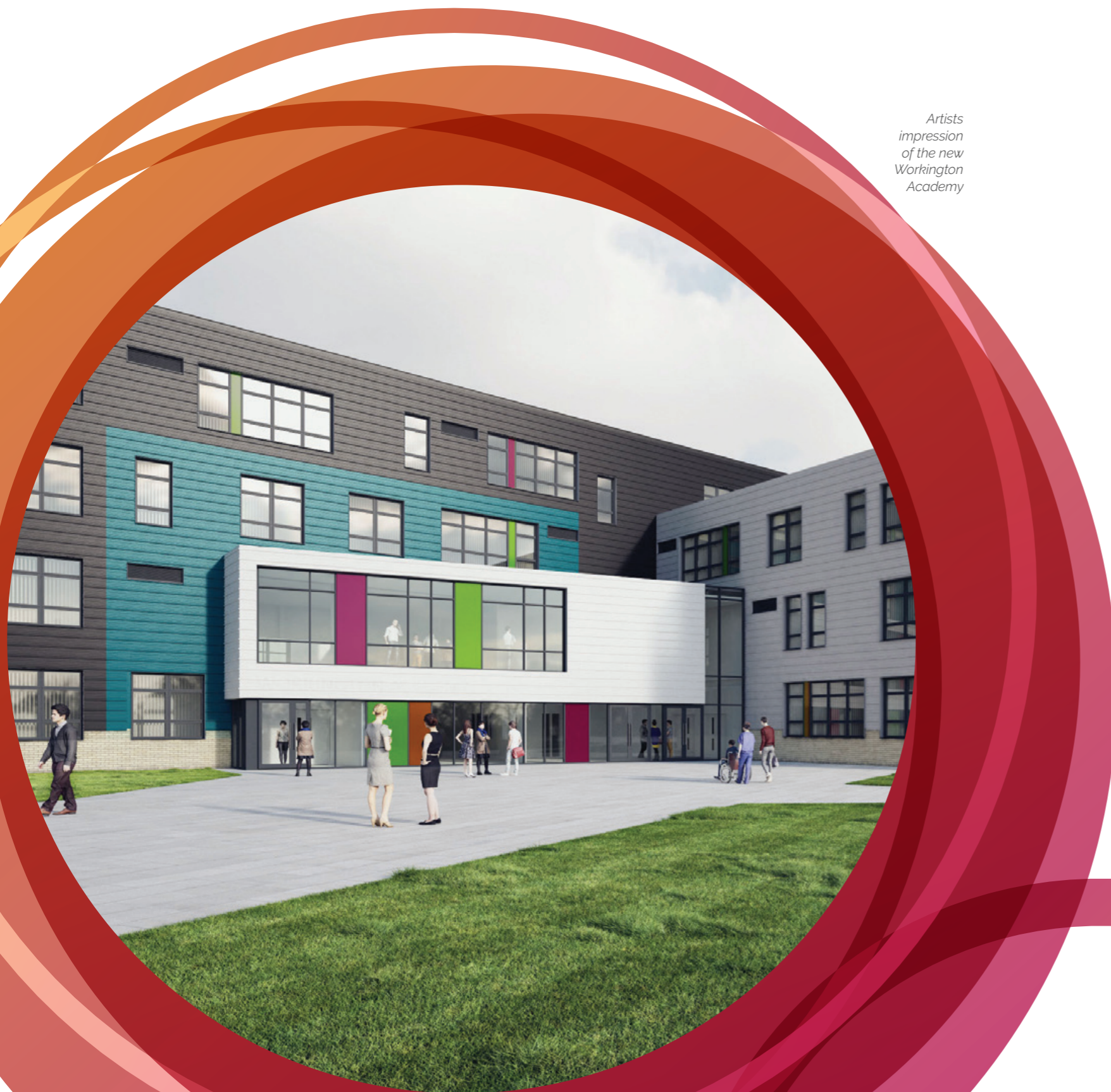
Artists impression of the new Workington Academy

If you are looking at your sixth form options, as director of learning at Workington Academy Sixth Form, I can assure you that you will be joining us at an exciting time.